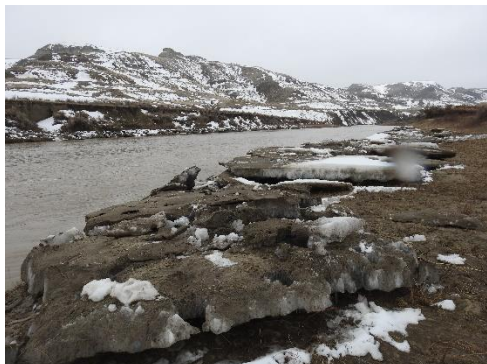
Above: First day of water sampling at the Pinhorn site on April 12, 2018.

and identifying gaps in our current knowledge. The team initiates science and research projects that will further understanding of the watershed health.