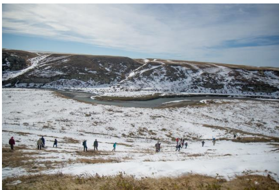
Above: Hiking the Milk! - Sandstone Ranch area, 2017