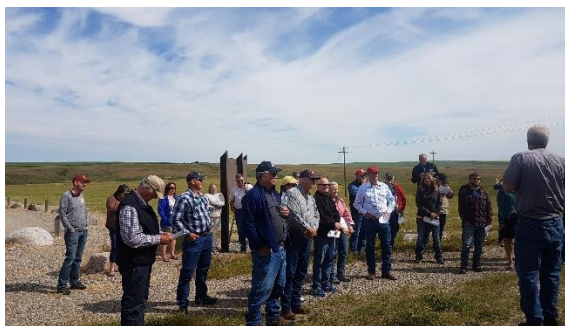
Above: Touring the Milk! - River Rendezvous Tour, the St. Mary's Dam - 2017

We look forward to an exciting 2018-2019 fiscal year, where we will continue to improve communication, education, and expand our outreach efforts. Plans are underway to review on-stream storage investigations for the Milk River and further press for long term solutions to economic, social, and environmental challenges within the watershed. We have many accomplishments to be proud of within our community, as demonstrated by the outpouring of community support at this past Community Appreciation Forum. Once again, thank you to all our program sponsors, donors, staff and volunteers that make our work not only possible, but rewarding.