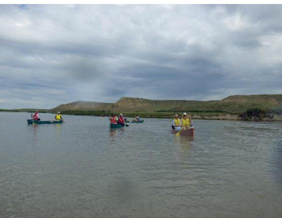
Above: Canoeing the Milk! - Eastern Reach, 2017