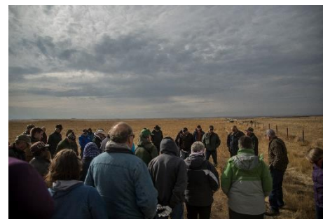
East Watershed Tour, October 2017.