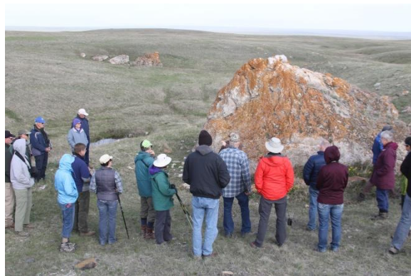
Above: Hiking the Milk River - 2016

Moving forward, the MRWCC has been working closely with our transboundary partners on both landscape scale issues such as native grasslands, invasive species, and soon a film project in recognition of the fragility of our current ties to the St Mary's and the connection between water, land use, and biodiversity. The MRWCC has been asked to place an updated State of the Watershed Report on hold by AEP and we anticipate asking our stakeholders to help us make a case for this important project and ensure an updated document that will be a valuable educational tool for both the scientific community and watershed residents in all three jurisdictions.