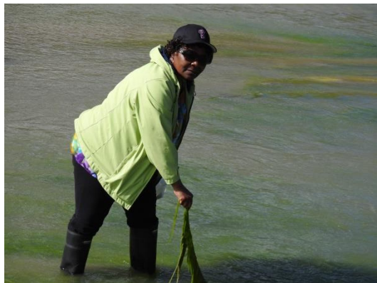
Above: Large mats of filamentous algae at the Pinhorn site in May 2016.

and identifying gaps in our current knowledge. The team initiates science and research projects that will further understanding of the watershed health.