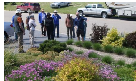
2016 Xeriscape Workshop.