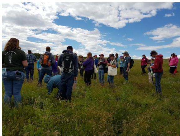
Above: Youth Range Days - 2016