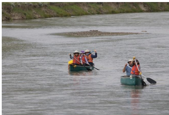
Above: Canoeing the Milk River - 2016