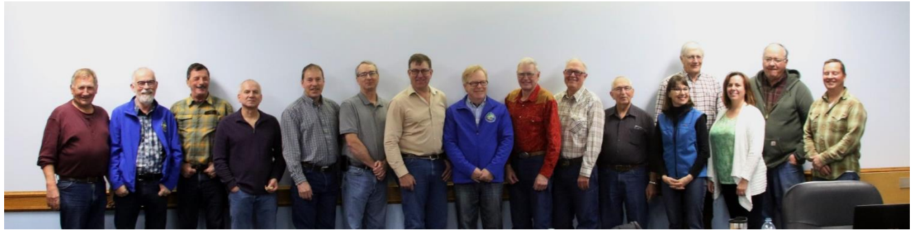
Above: Some of the 2016/17 MRWCC Board Members