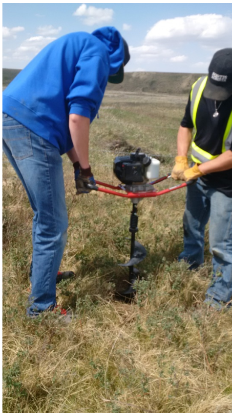
Above: Tree planting on Red Creek 2015

and identifying gaps in our current knowledge. The team initiates science and research projects that will further understanding of the watershed health.