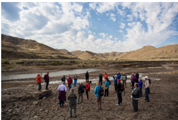
Above: Hiking the Milk River - 2015