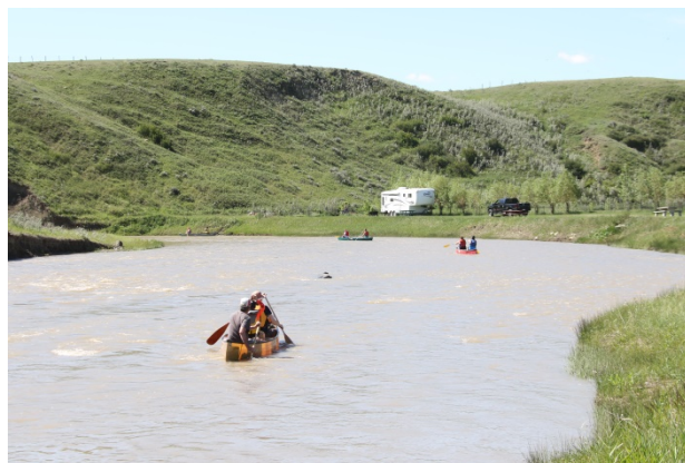
Above: Canoeing the Milk River - 2015

Moving forward, we are starting to ramp up Transboundary efforts in recognizing the connection between water, land use, and biodiversity. The MRWCC will be establishing a 2018 State of the Watershed Report team of technical experts from Alberta, Saskatchewan, and Montana in the coming months. We will also continue to share information and innovative programming with our Transboundary partners through the grasslands working group. The Council is working in tandem with our municipal partners to showcase our watershed this August at the Transboundary Weeds, Water, and Stewardship Tour.