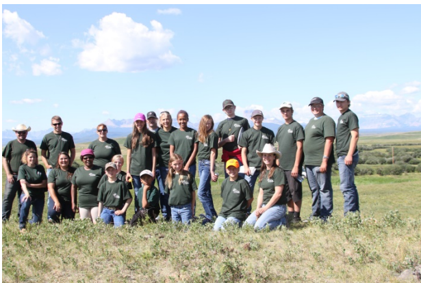
Above: Youth Range Days - 2015