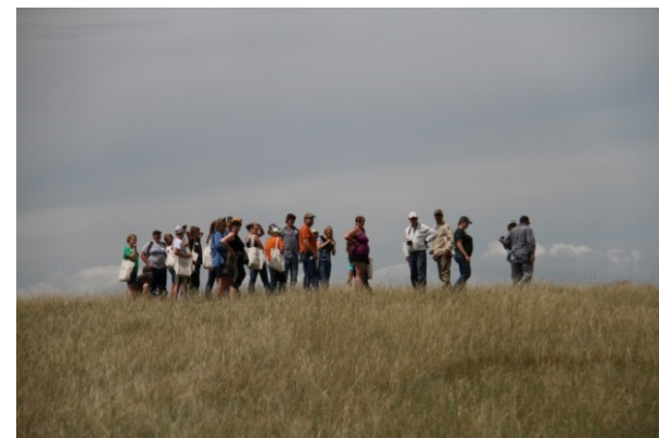
Above: 2014 Youth Range Days