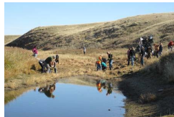
Above: 2014 Tree Planting Project