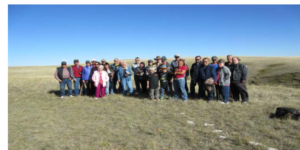
Above: 2014 Hike Tour Participants