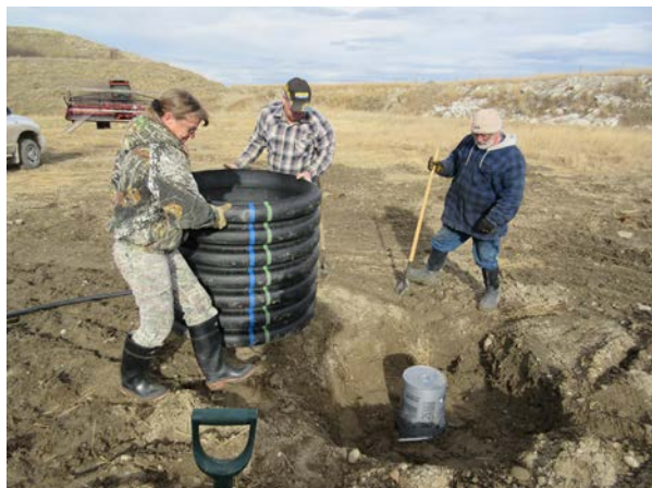
Above: Off-stream Watering Installation 2014

and identifying gaps in our current knowledge. The team initiates science and research projects that will further understanding of the watershed health.