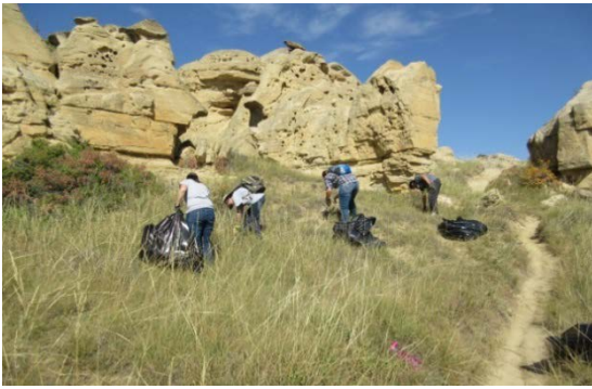
Above: 2014 WOSPP Weed Pulling Project