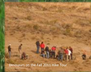
Dinosaurs on the Fall 2011 Hike Tour