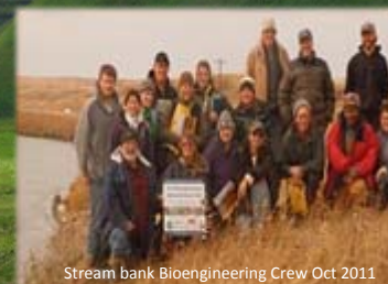
Stream bank Bioengineering Crew Oct 2011