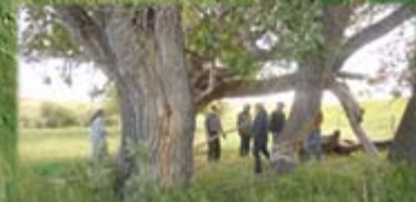
Cottonwood Wrapping on the Milk River Summer 2011