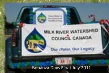
Bonanza Days Float July 2011