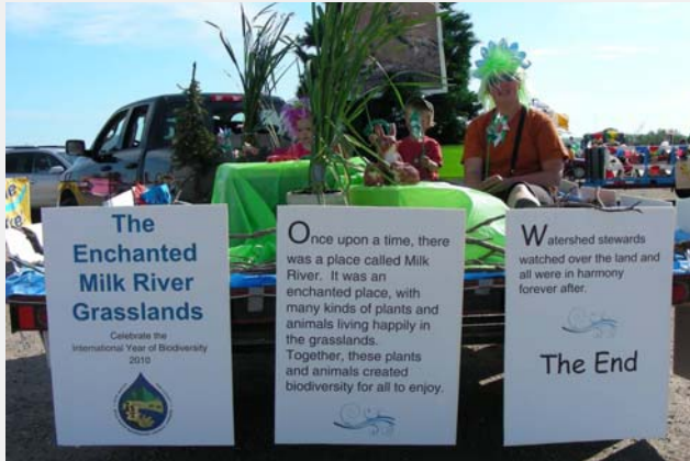
Above: MRWCC Bonanza Day parade entry.