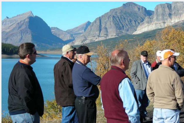
Above: Trip to the Milk River headwaters, Babb, Montana.